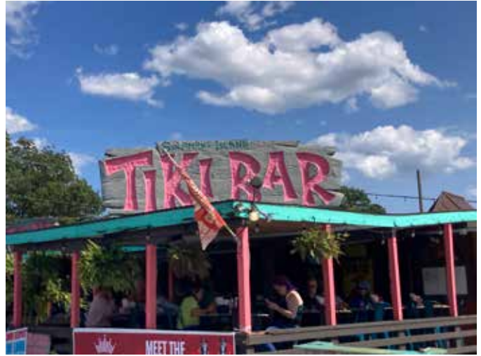
The Tiki Bar in Solomons, MD

August 27 - Onancock Wharf, Onancock, Virginia ( sleepy town, good restaurant at the marina, golf carts for rent, loaner car, free laundry)