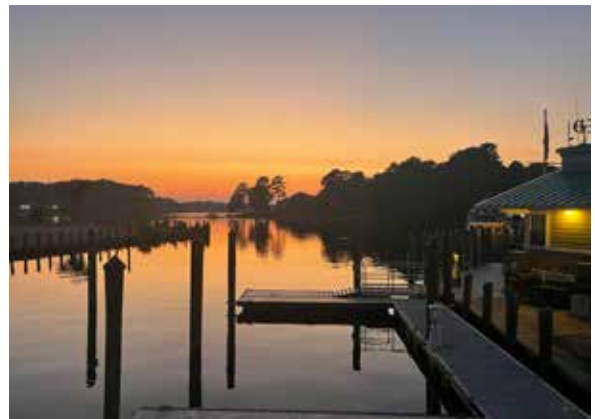
Onancock Virginia at sunset