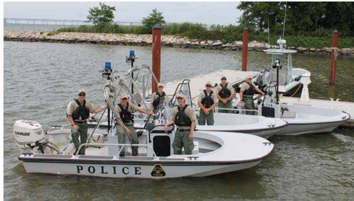
MD State Police heading out on patrol