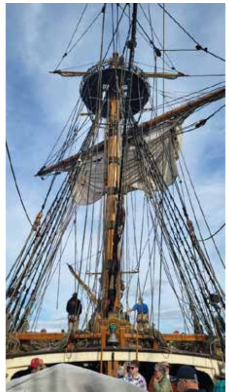
View from inside the Kalmar Nyckel,

The Pezelys and Beardsleys learned a lot about sailing after touring the museum which included a history of sailing and the creative types of vessels people invented to journey across the water centuries ago. Afterwards, they warmed up with dinner at the Fish Market in Wilmington.